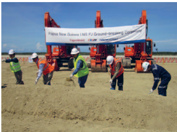
Brukim graun seremoni long proses eria

Papua Niugini Likwifait Netserol Ges (PNG LNG) Projek (Projek) i makim tupela bikpela wok kamap insait long namba wan kwata bilong 2011 wantaim wanpela brukim graun seremoni bilong wok konstraksen long ol proses tren na namba wan simen foundesen ol i kapsaitim long LNG Plent, we bai wanpela bikpela Projek fasiliti o ples wok.