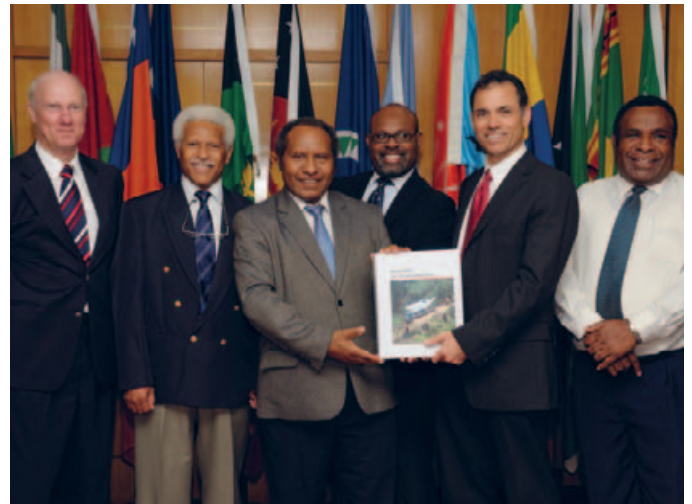
Ofisal presentasen bilong Hailens Haiwe, stretim na wokim haiwe rot kamap gut repot

Rot long go insait long graun em i wanpela bikpela samting long wok bilong Projek. Risetelmen na kompensesen wok bilong go insait long graun i go het insait long dispela kwata, wantaim moa luksave long Hevi Hol Rot, Kopeanda Lenfil Sait, Wellpad Ekses Rot, Komo Ples Balus, Hides Ges Kondisening Plent, Hides Kwari 1 and Hides Kwari 3 na sauten hap bilong paiplain. Projek i tok pait pinis, na karimaut planti long ol In-Prinsipal Kompensesen Agrimen wantaim 82 In-Prinsipal Kompensesen Agrimen ol mausman bilong ol hauslain o klen na Projek Menesmen yet i sainim pinis.