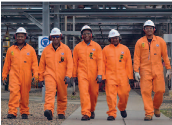
Ol graduet enjinia i mekim wanpela 18-mun developmen program

Projek i wok long strongim developmen bilong ol wokmanmeri bilong Projek, trening na helt wok bihainim groa na namba bilong ol wokmanmeri bilong em. Long pinis bilong mun Mas, moa long 7,000 manmeri wok long Projek. Moa long 5,300 Projek wokmanmeri em ol Papua Niugini manmeri yet, husat i makim 75 pesen long olgeta wokfos bilong Projek.