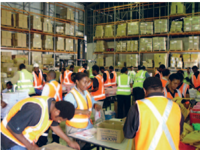
Redim ol skul pek long tilim i go aut

Luksave olsem agrikalsa em i wanpela bikpela samting insait long laip na sindaun bilong ol rural komyuniti long Papua Niugini, Projek i sapotim developmen bilong ol agrikalsa wok long ples, wantaim ol projek i go het pinis long Hides, Omati na long LNG Plent Sait. Ol dispela wok program i lukluk long promotim ekonomik developmen insait long ol ruel eria i sapotim ol komyuniti long planim ol fres gaden kaikai, sanapim ol lain diwai kesyu na halivim ol meri insait long Kikori eria long kamapim wanpela kampani bilong saplaim ol kago olsem ol sidling samting.